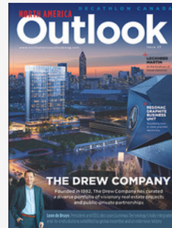
North America Outlook