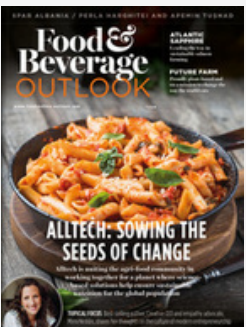
Food & Beverage Outlook