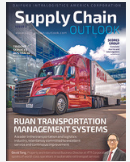
Supply Chain Outlook

We have two primary reasons for entering into event media partnerships. First: Our readers are interested in exhibiting and/or attending the events that we partner with. Second: Our Editorial Projects Team identifies and sources corporate success stories and potential interviews for upcoming issues of our business titles.